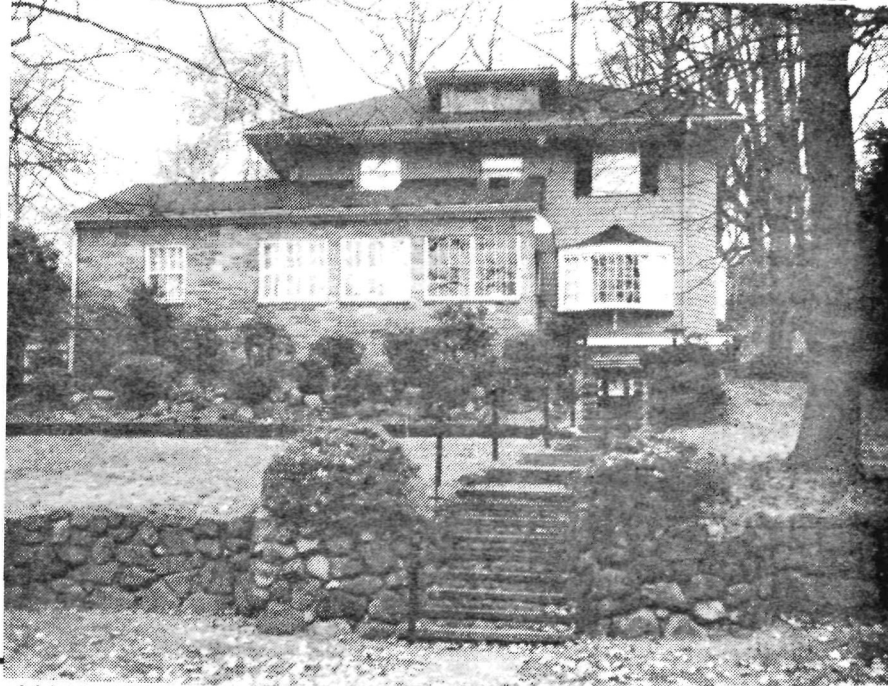
24009 231 Wyoming Ave., Mplwd $98,000. 1F